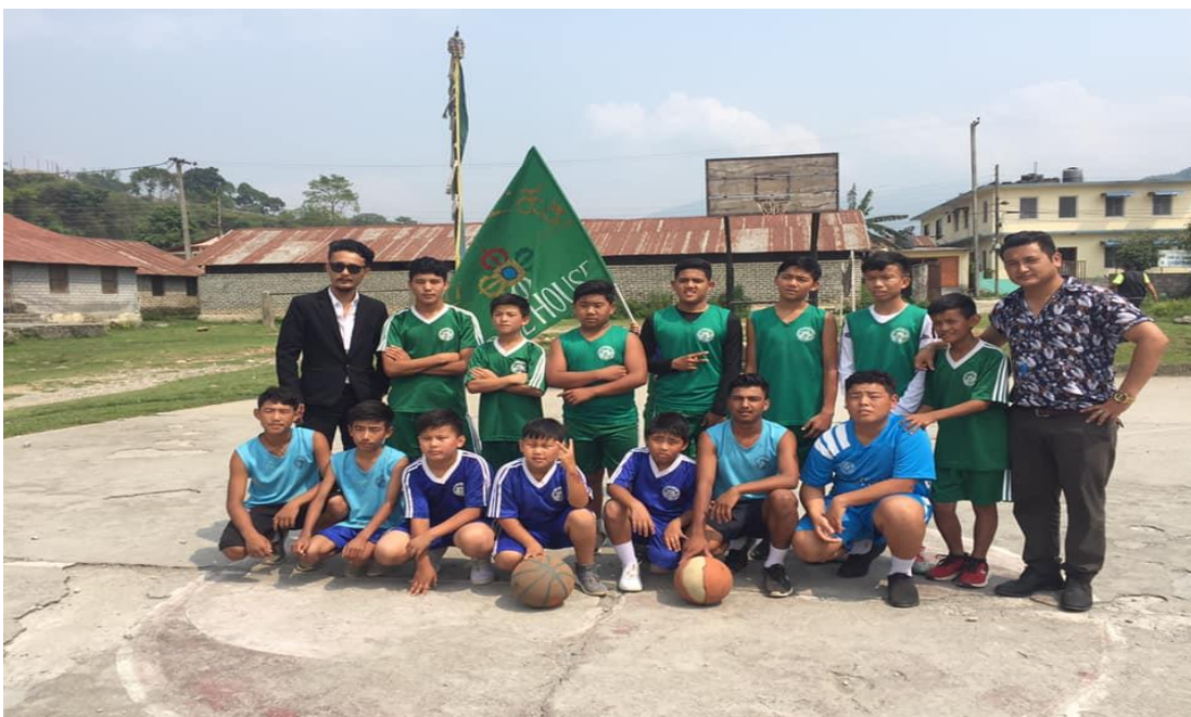
School basketball competition