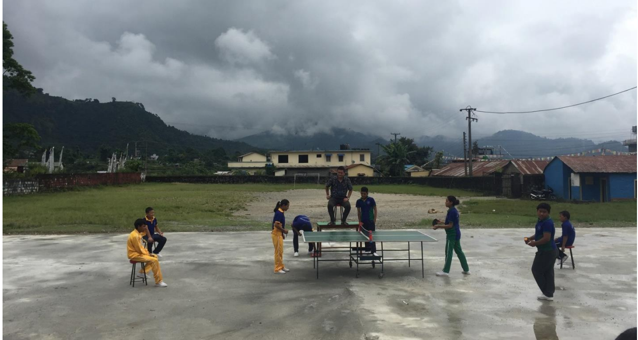
Inter- house table tennis- Sep 27, 2019