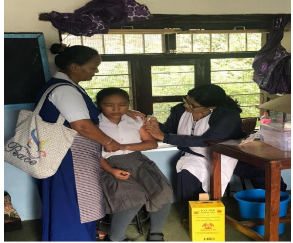
HPV vaccination for girl students

The new counseling room for the safe guard of the children is built this year. With that we were able to renovate the school classrooms with ventilations, fan, soaps and soap cases in the bathroom as recommended by Safety Audit report of NFCC Nepal.