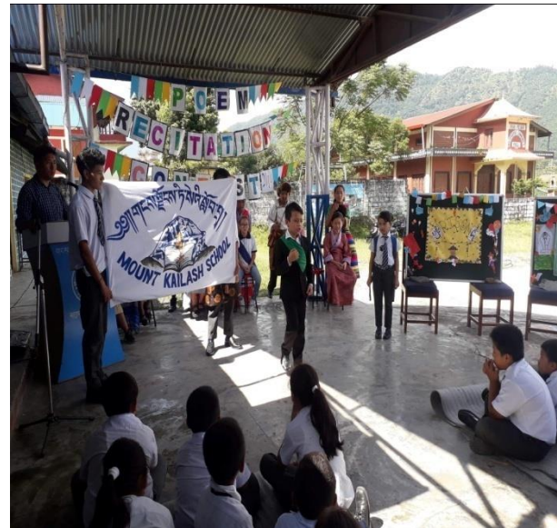
Inter-house poem recitation